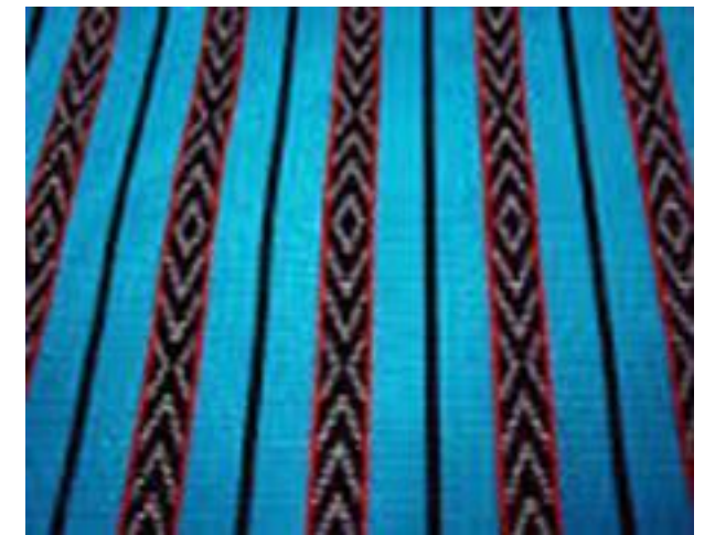
Figure 4. 'Minatmata'****