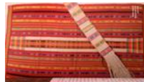
Figure 2. 'Pinaggagan'**