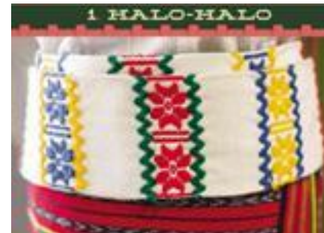
Figure 1. 'Kinulibangbang' design*